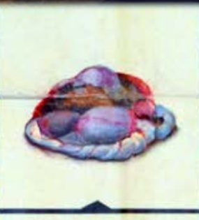
FAT OF INWARDS