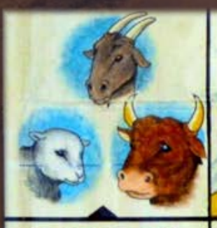
COMMON TO ALL